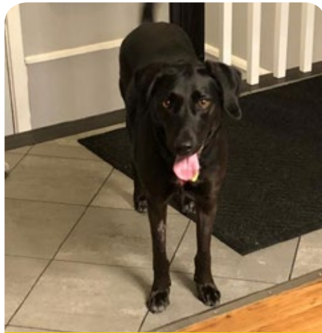
Nikki LABRADOR RETRIEVER MIX MEDIUM, ADULT, FEMALE