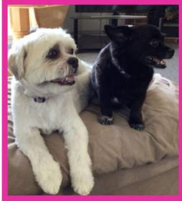
Benji & Fifi