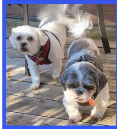
Pearl and Gizmo