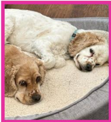
Lady & Smarty